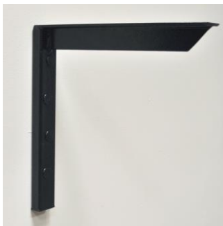
flush mount install

Available in 3 sizes: 12x12, 18x18 & 24x24 Packaged 2 per box 1/8" steel construction with 1/4" mounting holes (finishing caps provided for flush mount) Load limit range of 400 lbs to 2200 lbs per pair Available in Black or White